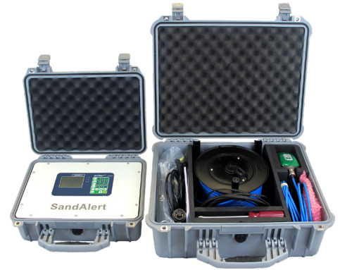
iSensys SandAlert Portable Monitor Complete Toolkit

When the prediction and handling issues have been carefully considered, including an understanding of erosion risk and sand removal challenges.