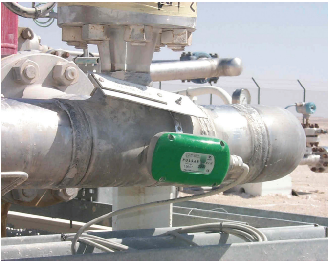
PulsarGuard 2001 on a pipe

For more information on our service offerings, please visit the website or contact one of our head offices.