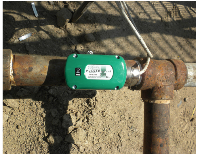
PulsarGuard 2001 sensor receiving a signal from a pipe.