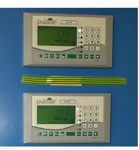
Pulsar Measurement Zenith controller in a real-life panel.

Manual switches may be linked via the digital inputs enabling choices of pump overrides to reset alarms or pumps back into service.