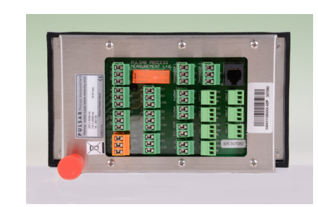
Pulsar Measurement Zenith stainless steel enclosure.

Conversion of the level measurement into stored volume throughput, with the ability to accommodate a variety of good shapes and to custom linearize for non-standard wells is included. This feature is useful for monitoring local flow changes and for well capacity performance when part of an integrated system.