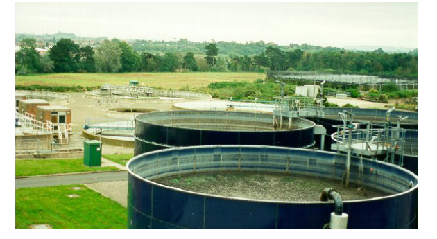
Sludge settlement tanks at a Sewage Treatment Works.

Sludge Finder 2 is designed to be maintenance free. Sludge Finder's Viper transducer is a single beam ultrasonic unit immersed just below the liquid surface. A wiper blade sweeps the transducer face, ensuring that it remains clean. The Viper transducer may be positioned up to 200 m (656 ft) from the control unit and has a measurement range of 0.3 m to 10 m (0.98 ft to 32 ft). Accuracy is 0.25% of the measured range. A tight 6 degree beam angle and sophisticated echo processing algorithms makes sure that Sludge Finder 2 deals with difficult tanks and rotating equipment with ease.