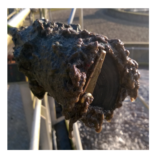
Viper transducer doing it's job!