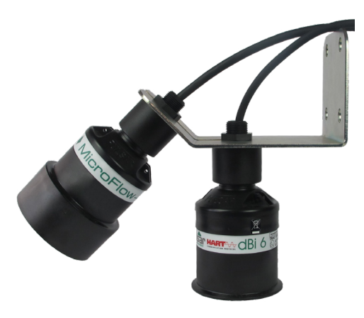
The MicroFlow-i and dBi low powered sensors for CSO Network Monitoring.

For more information on our service offerings, please visit the website or contact one of our head offices