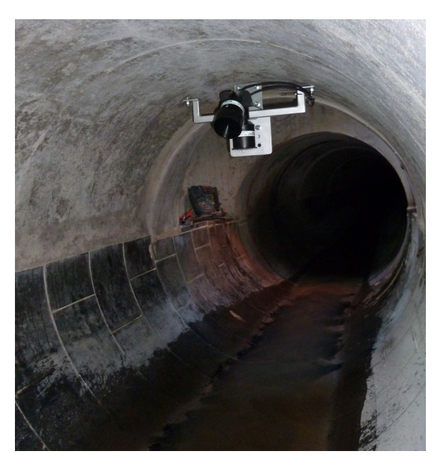
MicroFlow-i Measuring Flow Velocity

Management of pollution under flood conditions is a significant challenge and, with ever more demanding monitoring regimes, operators have implemented thousands of CSO monitoring installations and thousands more are planned, with data logging and level measurement to record spill events. Looking beyond CSO, there are good reasons to monitor flow throughout the wastewater network to identify problem areas, alert maintenance teams, and generate corrective action.