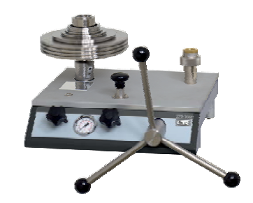
Deadweight Tester/Pressure Balance CPB5000

Specifications according to data sheet CPB5000