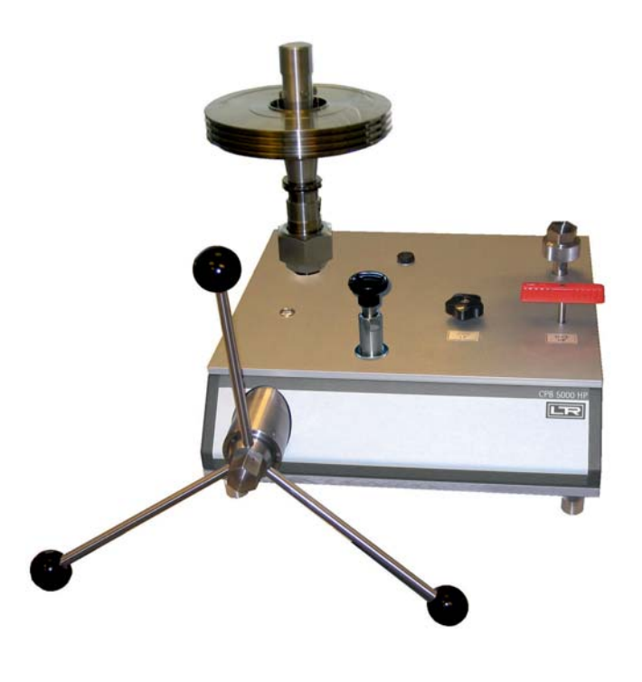
High-pressure Deadweight Tester/Pressure Balance CPB5000-HP