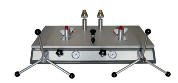
Differential Deadweight Tester/Pressure Balance CPB5000-DP

Specifications according to data sheet CPB5000-DP