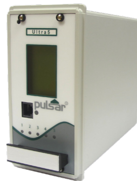
Ultra 5 Panel Mount Unit