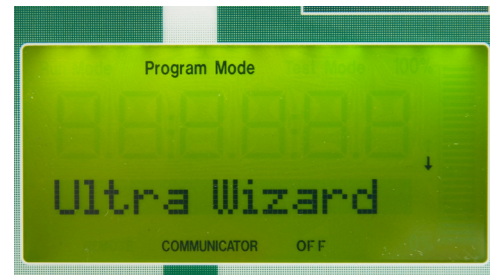
Ultra Wizard on-board, menu-driven software

A data logging board is an optional extra with RS485 connection and large data log capability together with Profibus DP V0 and V1 or Modbus Communications.