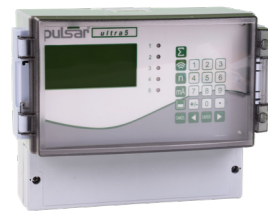
Ultra 5 Wall Unit

Simply enter the programming code and UltraWizard will lead you through a set-up menu. The user is led into a 'Quick Set up' menu specific to the application type that allows parameters such as empty and full distances and alarm/control relay settings to be entered. The majority of applications will be 'ready to go,' while it is easy to finish off the more demanding installations via further menus, refining the programming to add extra sophistication such as Ultra 5's advanced pump control routines.