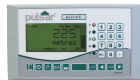
Ultra 5 Fascia Unit