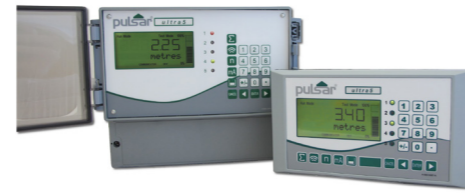
Ultra 5 Wall and Fascia Unit