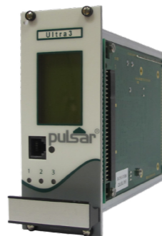
Ultra 5 Rack Mount Unit