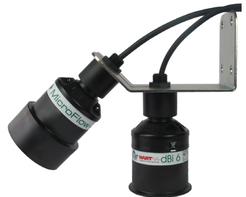
The MicroFlow-i and dBi low powered sensors for CSO Network Monitoring.

For more information on our service offerings, please visit the website or contact one of our head offices.