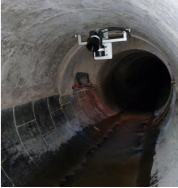
MicroFlow-i Measuring Flow Velocity

Management of pollution under flood conditions is a significant challenge and, with ever more demanding monitoring regimes, operators have implemented thousands of CSO monitoring installations and thousands more are planned, with data logging and level measurement to record spill events. Looking beyond CSO, there are good reasons to monitor flow throughout the wastewater network to identify problem areas, alert maintenance teams, and generate corrective action.