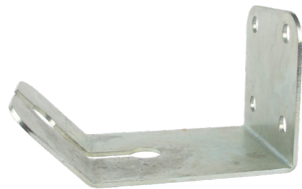
MicroFlow angled bracket

PC software is available to allow setup and run diagnostics using the MicroFlow PC via the RS485 connection. The PC software enables users to be able to set up, test, obtain and record readings from a sensor, giving users an idea of signal strength, stability, device parameters, and much more.