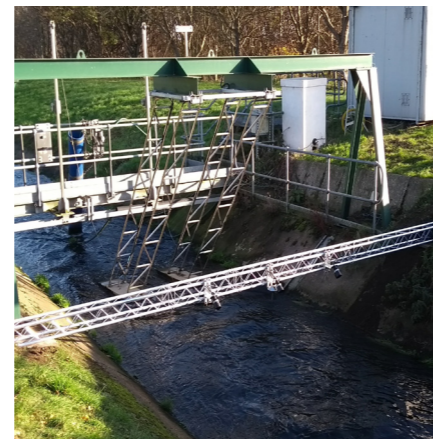
3 MicroFlow's on a wide channel