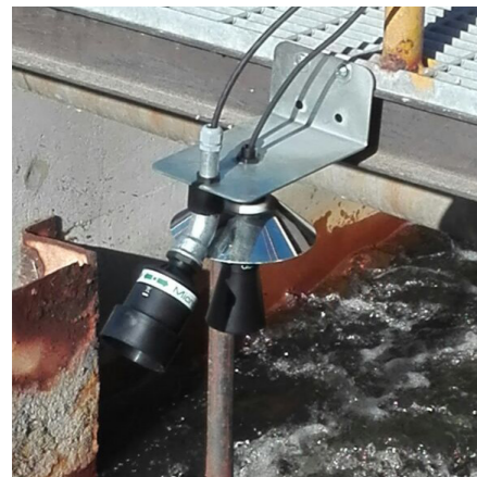
MicroFlow and dBMACH3 in a wastewater application

Thanks to Pulsar's award-winning and world-leading non-contacting technology, the MicroFlow sensor range does not include any serviceable parts and because it makes no contact with the application, there are no wear and tear issues.