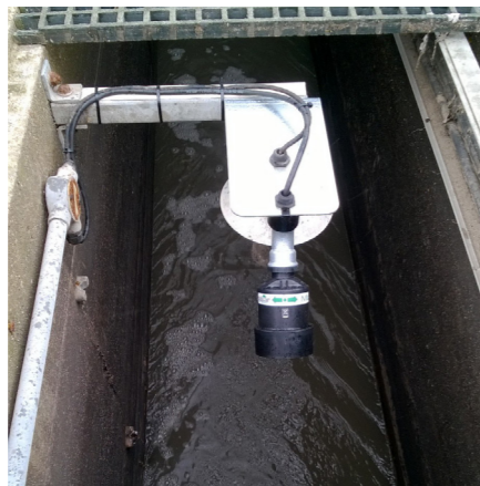
MicroFlow and dBMACH3