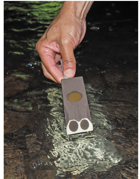
QZ02L Hyrdodynamic Sensor

MantaRay is easy to calibrate with its built-in keypad and simple menu system. Mount the sensor on the bottom of a pipe or open channel and hang the electronics enclosure above the high water level.