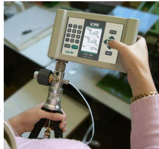
LPC 300 with calibration pump LPP 30 "on site"