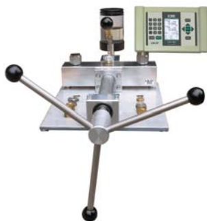
Pressure comparison pump LSP with LPC 300

In "measuring" operation, the LR-Cal LPC 300 displays simultaneous: