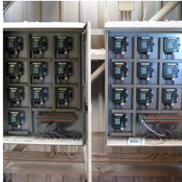
20 Blackbox Units housed in control cabinet.

The system of choice for this site was the Blackbox controller accompanied with the dB15 Transducer Series, the Blackbox is compact and easy to install, a useful timesaver for the site was the ability to clone several of the units using the same programming parameters. As the silos were all a similar size, they could all be pre-programmed before installation, which reduced process downtime. The 20 Blackbox units, two for each silo, were mounted in a control cabinet, and each connected to a Pulsar dB15 Transducers mounted on an aiming kit so that it could be directed towards the silo draw-off point. The units were then multiplexed through a Profibus connection to the site SCADA system.